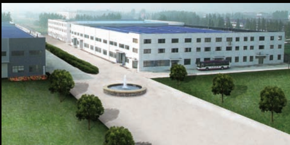
Jiangsu Chantey Hytec Automotive Pumps, LLC brand new facility

Hytec Automotive is pumped to compete globally with its new TS-16949 NQA-certified manufacturing plant in Dafeng City, China. In a joint venture with Hytec Automotive USA, Jiangsu Chantey Hytec Automotive Pumps, LLC is buzzing with capacity to produce 2.8 million water pumps annually.